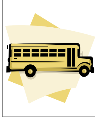
A school bus performs its duty best when it's running.

If you have gotten a little lax in performing your pre-trips, I encourage you to start up again. If you have any questions, please feel free to ask.