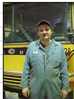
Alexandr the Great